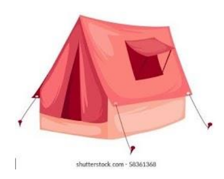
Ans picture -3